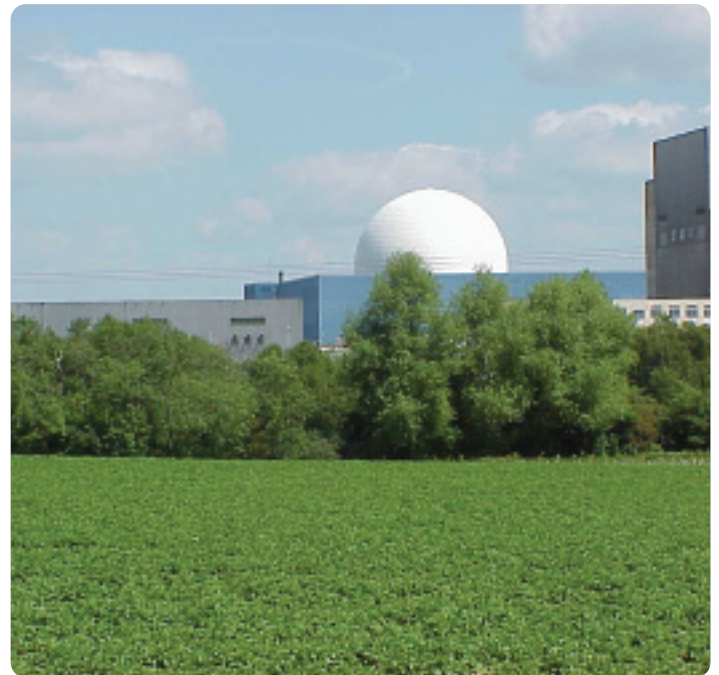
View of the existing power stations at Sizewell. Sizewell C would be built on land to the north of Sizewell B (shown above).

EDF Energy will be consulting on its proposals prior to submitting a planning application for Sizewell C in 2011. We want to find out your views and engage with the community as the plans progress. We will be sending out newsletter updates to keep you informed and will be organising exhibitions in your local area in 2010 where you can find out more and meet the EDF Energy team.