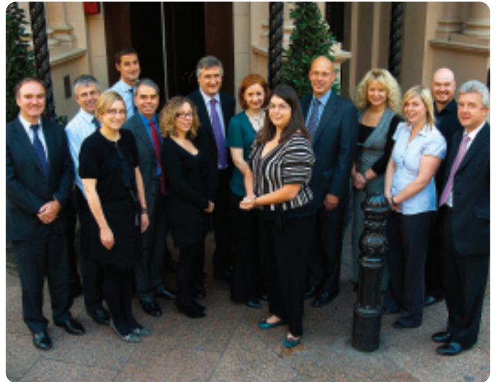
EDF Energy's dedicated nuclear new build team