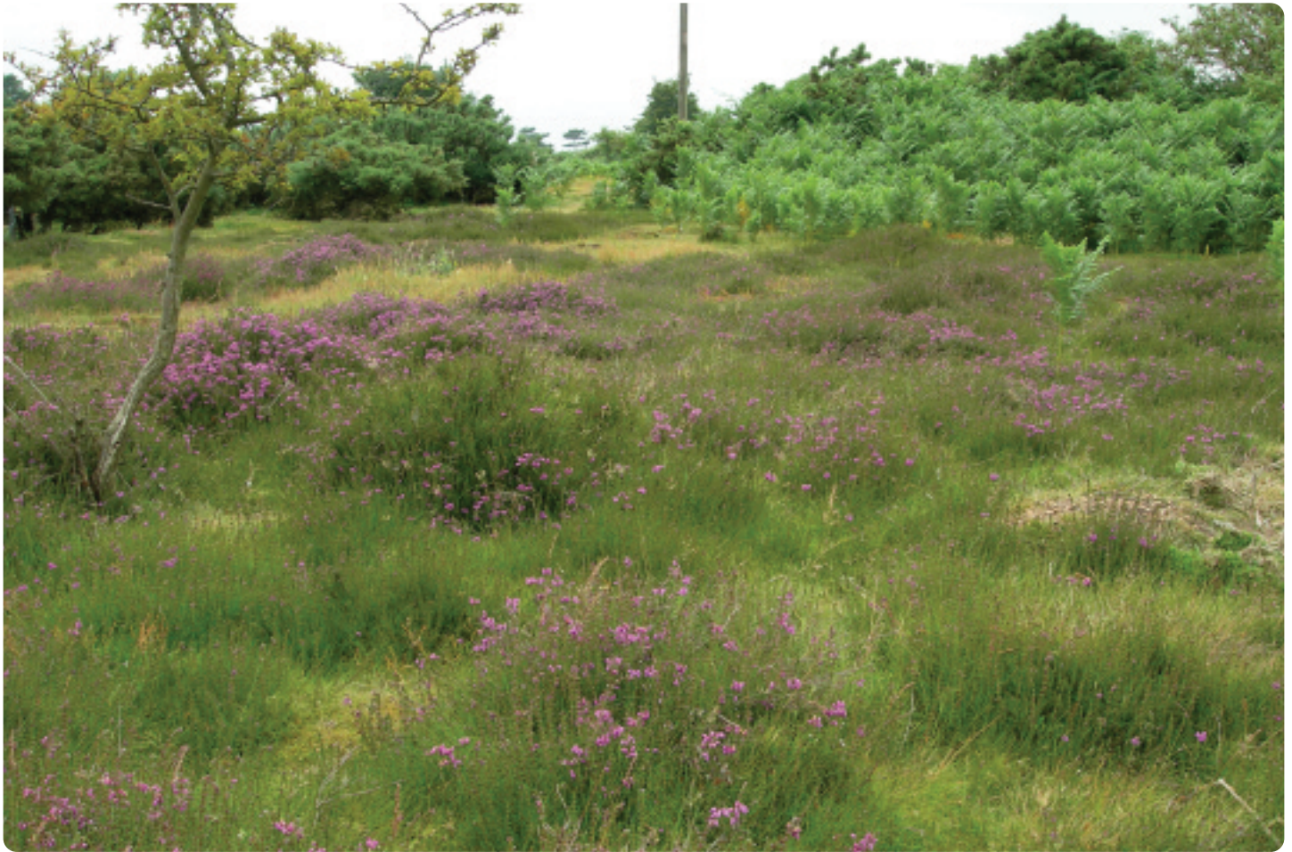
Heathland habitat at Leiston Common, part of the EDF Energy estate