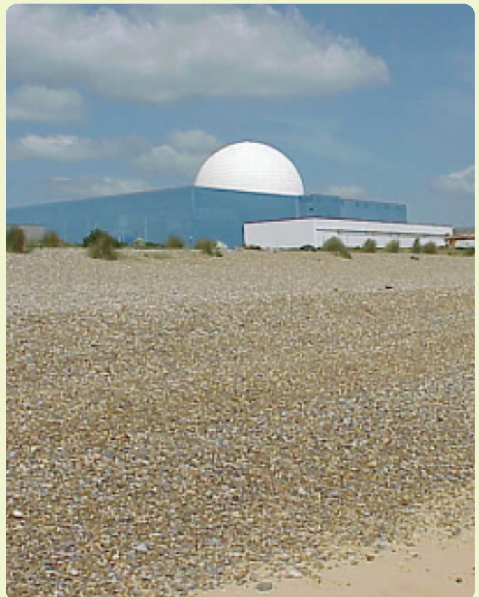
View of Sizewell B power station from the beach

or email mail@sizewellspentfuelproject.co.uk